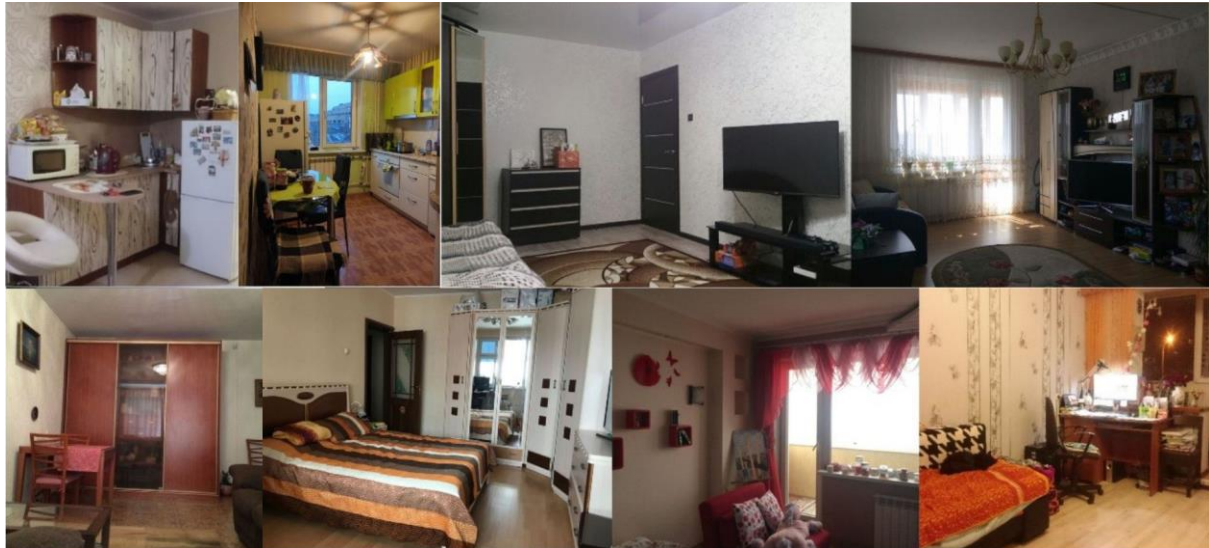
Figure 2. Modern interiors of a mainstream city resident.

tablecloths, crystal glassware and wooden souvenirs which used to prevail in Soviet interiors (Figure 2).