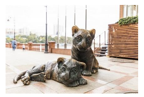
Figure 2. The pedestrian street of Admiral Fokin of the city of Vladivostok.