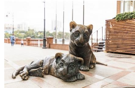
Figure 4. Tiger cubs on the Sportivnaya Embankment of the city of Vladivostok

The principles of the artistic and stylistic organization of the architectural and spatial environment of pedestrian streets, the application of corporate styles (figure 2) play an important role in the organization of the urban environment.