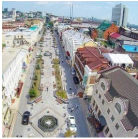
Figure 2. The pedestrian street of Admiral Fokin of the city of Vladivostok.

Today it is necessary to design easily erected, mobile, easily replaceable elements and structures of urban design, take into account the changing situation in the formation of the urban environment, reflecting the daily, seasonal, festive conditions that turn the street into an easily updated system. Such a new organization of urban design forms, due to its great flexibility, forms the connection between the historical components and the current state of the streets.