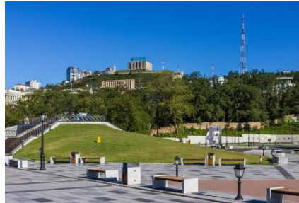
Figure 3. The Tsarevich Embankment of the city of Vladivostok.