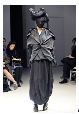
Figure 2. Deconstruction in contemporary Japanese fashion designers creative works: a) Yohji Yamamoto; b) Rei Kawakubo; c) Issey Miyake; d) Junya Watanabe.

Deconstruction in clothes was first represented during Paris Fashion Week in 1981 where Yohji Yamamoto and Rei Kawakubo showed their fashion collections. Their works resonated with the public as the designers broke all existing European fashion conventions. Their models were quaint loose garments combining features of different clothing items which interacted with the figure in a