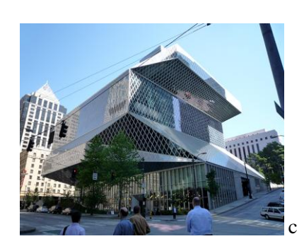
Figure 1. Examples of Deconstruction Architecture:

a) Dancing House by Vlado Milunic and Frank Owen Gehry, Prague, Czech Republic, 1996; b) Royal Ontario Museum by Danien Libeskind, Toronto, Canada, 2007; c) Seattle Central Library by Remment Koolhaas, Seattle, USA, 2004